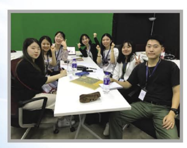
Some of the participating students

Daejin University mobility programme is an ISC signature programme that has been conducted since 2017. For 2019, the programme was run by 6 senior lecturers of the English Language Department. 20 students from Daejin University were here for 4 weeks of lessons and activities in the English Communication programme which included cultural visits.