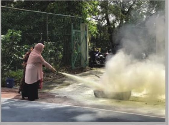
A student extinguishing a fire