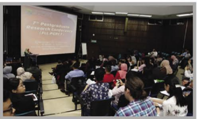
Welcome Speech by the Dean of FLL